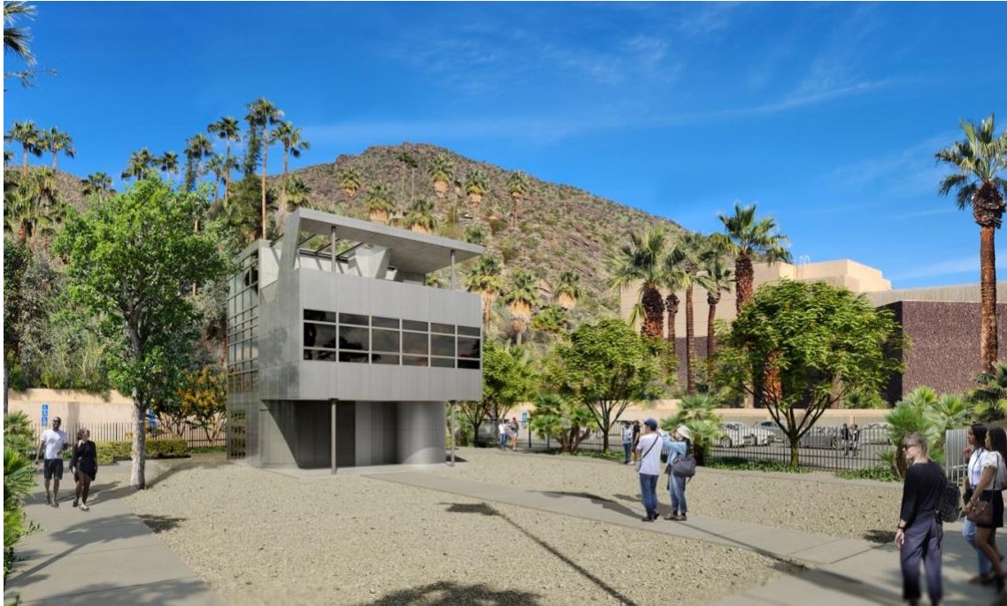
Caption: Aluminaire House ™ on-site at Palm Springs Art Museum, 2023. Rendering by Claudia Cengher.

PALM SPRINGS (September 28, 2023) – Palm Springs Art Museum is delighted to announce the upcoming permanent exhibit of Albert Frey and A. Lawrence Kocher’s seminal prototype structure Aluminaire House ™ on the museum’s downtown Palm Springs campus. Named after its aluminum components, the Aluminaire House ™ is an important work of architecture conceived of as an experiment to explore new industrial materials and Modern design in the creation of low-cost housing. It is representative of Frey’s utopian belief that the power of U.S. industry could be used to create affordable housing for everyone. The structure will be accessible in February 2024 on the museum’s south parking lot and will be timed to the exhibition Albert Frey: Inventive Modernist that opens January 13, 2024 at the Architecture and Design Center, Edwards Harris Pavilion.