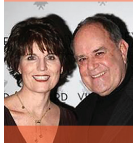
Lucie Arnaz & Laurence Luckinbill Actors

“The Annenberg Theater has been home for Palm Springs Art Museum’s performing arts for nearly 40 years, and its programs have provided our desert communities with a rich and culturally diverse array of music, theater, dance, cabaret, films, lectures and special events. We’re grateful to the Annenberg Theater Council for raising funds that keep this facility on the cutting edge!”