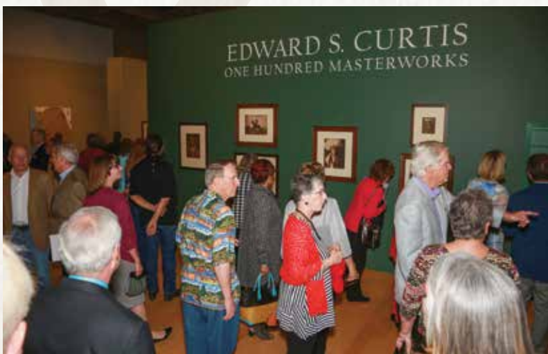
WAC members enjoying gallery tour of Edward S. Curtis: One Hundred Masterworks