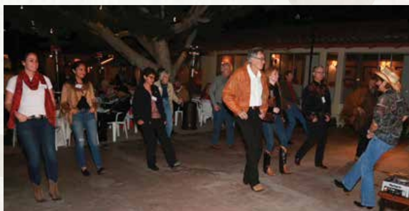
WAC members enjoying line dancing