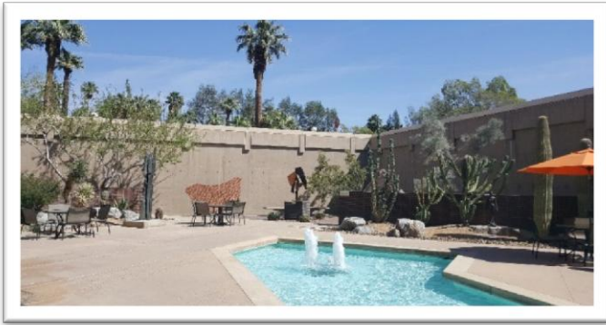
The Meyerman Garden

Are you interested in a volunteering opportunity working outdoors in the Sculpture Gardens? Then this could be the perfect fit for you! Gardening is one activity that will allow you to make a difference in the appearance of the museum’s gardens. It gives a feeling of real satisfaction that the plants and trees look better because of your efforts.