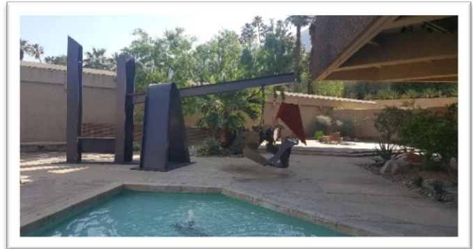
The Elrod Garden