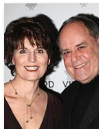
Lucie Arnaz and Larry Luckinbill Theater Patrons

"Don't let the contemporary vibe and forever-young good looks fool you. For over 40 years this amazing home for Palm Springs Art Museum's performing arts programs has provided our desert communities with a rich and culturally diverse array of music, theater, dance, cabaret, films, lectures and special events. Thank you, Annenberg Theater Council for raising funds for new equipment and improvements—keeping this facility on the cutting edge!"