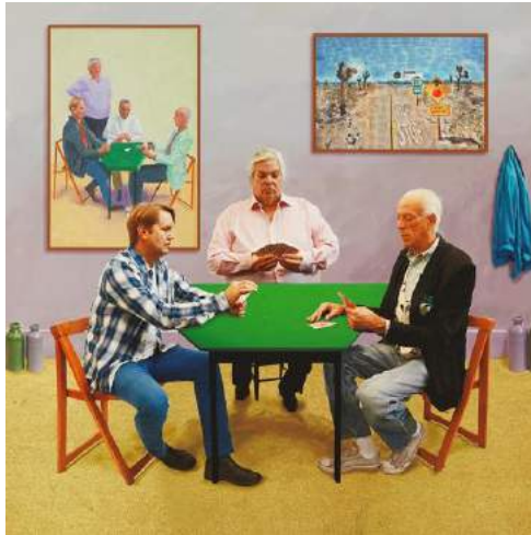
David Hockney, The Card Players , 2015