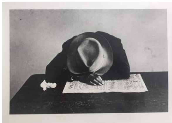
Ralph Gibson, Sleeping Man , 1960

Palm Springs Art Museum has been the beneficiary of a wonderful trove of photographs and photo-based contemporary art over the past season. As Acquisitions Chair, I would like to share them with you (listed below in reverse chronology from the most recent