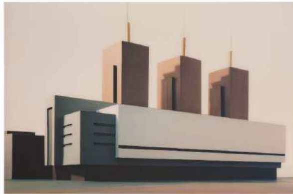
Thomas Demand, Fabrik (Ohne Namen) , 1994