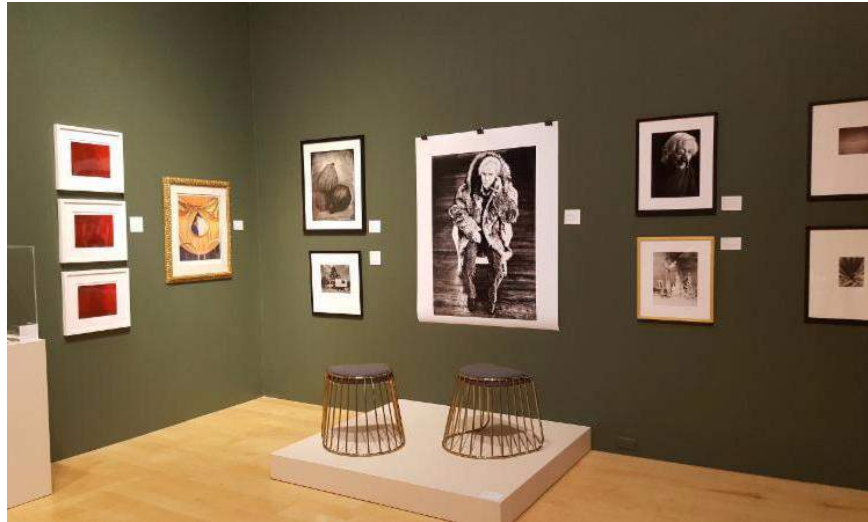
Photography auction items on view during the preview celebration