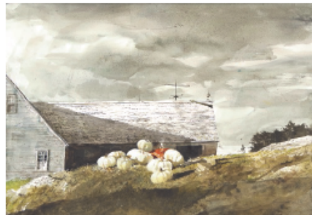
Andrew Wyeth, Albinos Study, 2002, watercolor

At 10:30 a.m. we will gather in the Annenberg Theater to hear about MAC's mission to fundraise for the museum's educational programs and also about our exciting season lineup. Following the brief presentation we will split into smaller groups to enjoy a Docent-led tour of Andrew Wyeth in Perspective . Andrew Wyeth (1917-2009) was one of the best-known artists of the middle and later 20th century. Known for his intensely realist style, he exhibited an extraordinary technical mastery of several different media.